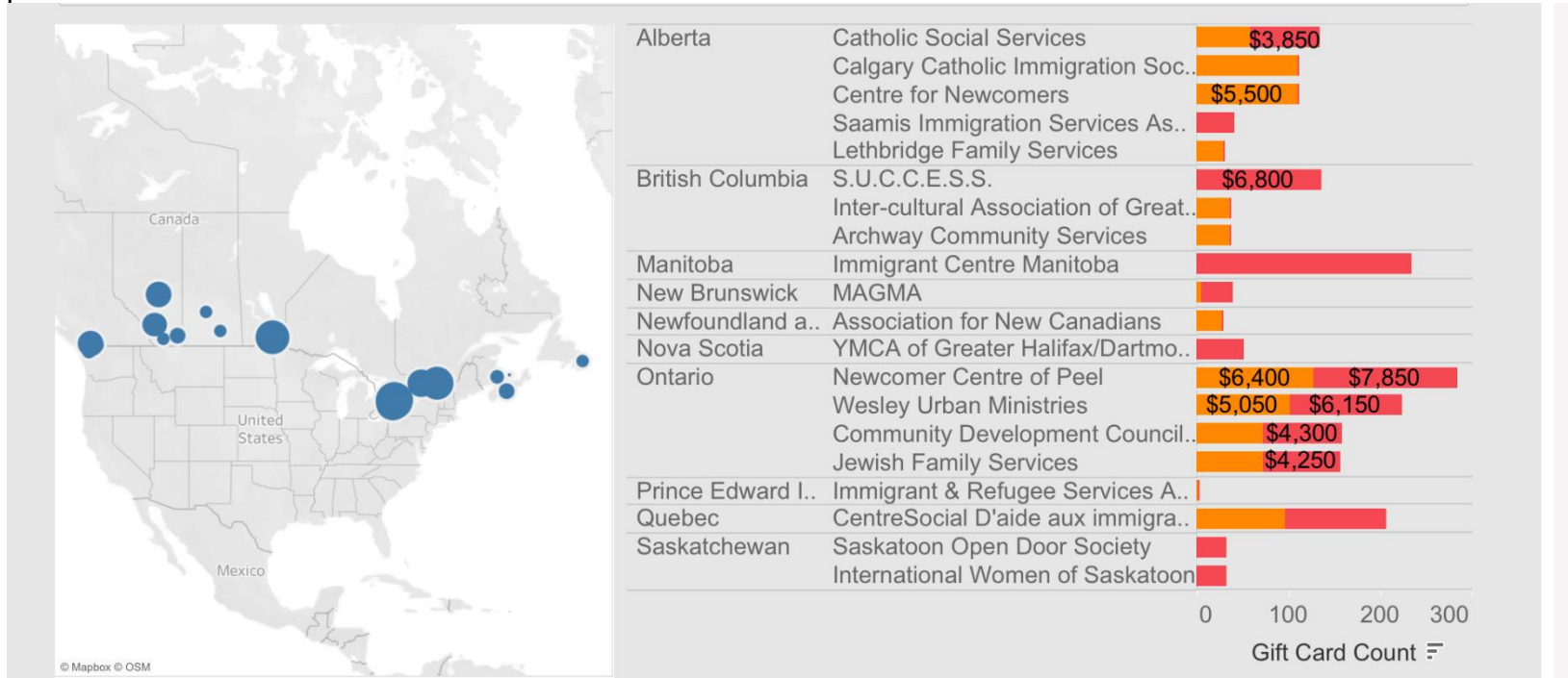
Figure 2: Distribution of gift cards by province/territory and by agency. The bar chart below illustrates the distributed number of gift cards. The amount was determined by ESDC’s Transitional Financial Assistance Data as well as the required amount by the provincial and territorial partners.