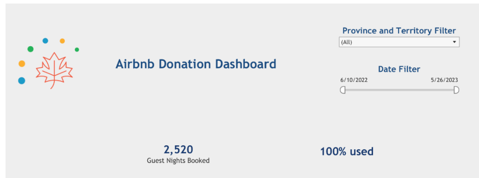
Figure 2: Airbnb.org bookings to support displaced Ukrainians.

OUSH-OHPU has developed an interactive map visualize the locations where temporary housing was utilized. This visualization can be accessed online (password dakuju ) and provides a geographical representation of the temporary housing placements.