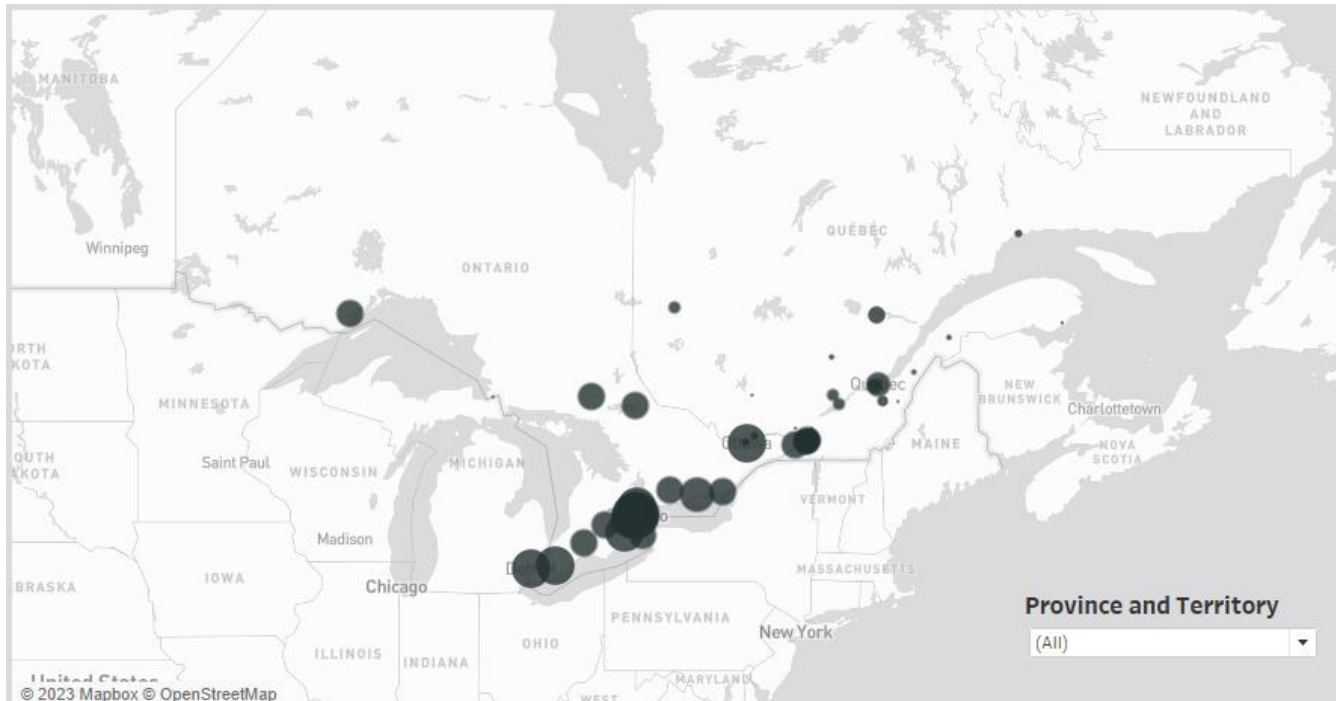
Figure 2: Distribution for each city

CISSA-ACSEI created an interactive map to visualize the distribution of gift cards donated by Metro Inc. The visualization is accessible online (password dakuju ).