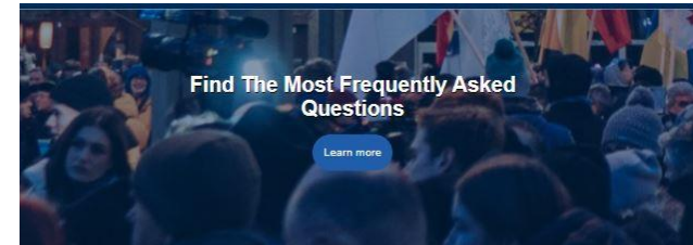
Canada Goose Contributes Over 2000 Parkas, Jackets and Accessories to Support Displaced Ukrainians and other newcomers in Canada

https://www.facebook.com/photo.php?fbid=420229254104004&set=pb.100083507972936.-2207520000&type=3