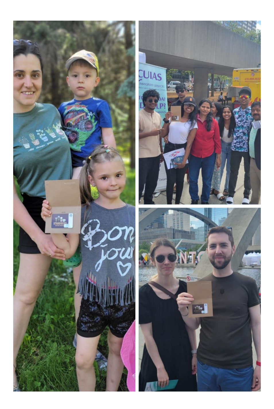
Impact Report – Starbucks Donation to displaced Ukrainians arriving in Canada Page 4

OUSH-OHPU, the Government of Canada, the provincial and territorial coordinating partners, as well as the settlement agencies would like to join their voice to those of the displaced Ukrainians to thank Starbucks for their generous donation and the impact it had in the lives of displaced people in need. Дякую!