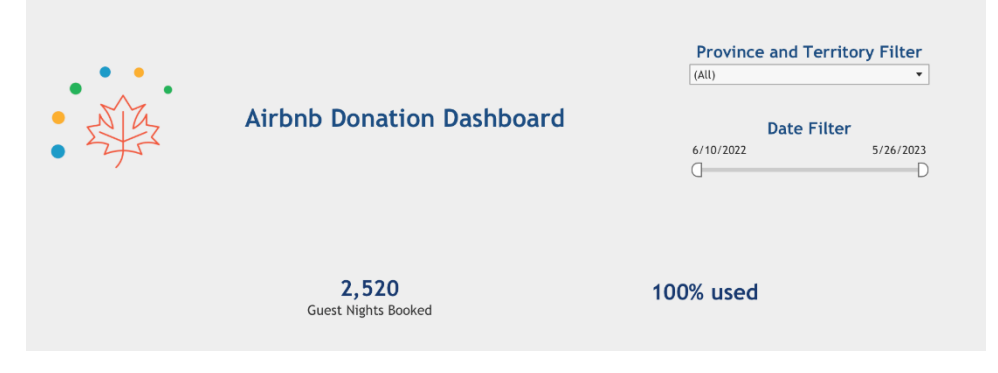
Figure 2: Airbnb.org bookings to support displaced Ukrainians.

OUSH-OHPU has developed an interactive map visualize the locations where temporary housing was utilized. This visualization can be accessed <u>online</u> (password dakuju ) and provides a geographical representation of the temporary housing placements.